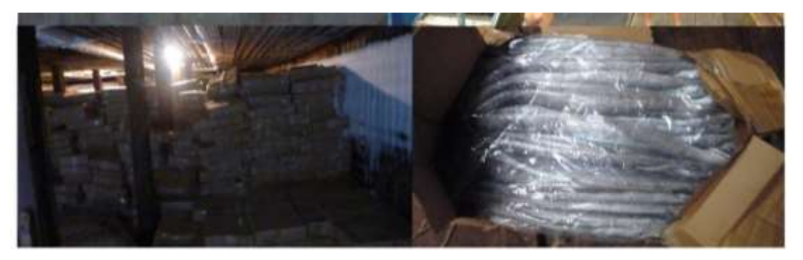
Figure 2. IUU fishing vessel involved in transhipping (as indicated by undeclared, packaged fish products in the hold) apprehended 25<sup>th</sup> July 2017.

neighbouring Gabon; and (4) increasing engagement with the marine marchande (who are responsible for regulation of vessel navigation and maritime transport).